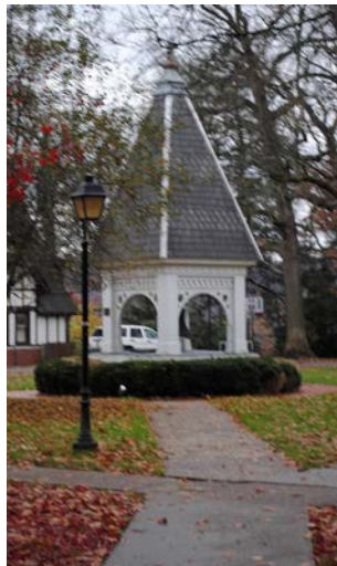
Kiski Prep School

Since we were no longer under the "Stay and Home" restriction, we planned a driving tour. We took the back roads and briefly stopped at the Kiski School, a beautiful private boarding school. Our next stop was the Loyalhanna Dam Park. We had an opportunity to chat and exchange stories while maintaining our safe six-foot social distance. Our final stop was at a couple of gourmet fast food restaurants to order a take-out lunch. We re-assembled at an adjacent shopping center parking lot to enjoy the lunch and continue conversations while maintaining a safe social distance from each other. Considering the restrictions, this worked, and everyone enjoyed the tour.