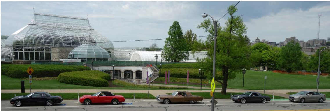
Start of the Tour at Phipps Conservatory