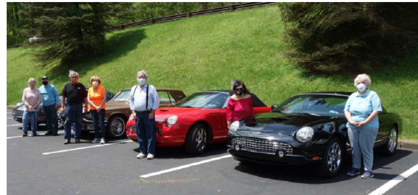
Loyalhanna Dam Park