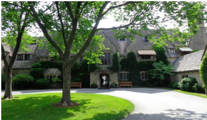
Tour of the Edsel and Eleanor Ford Estate