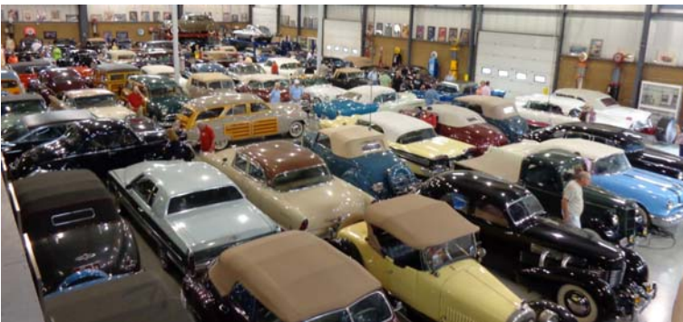
Meurer Automobilia Collection