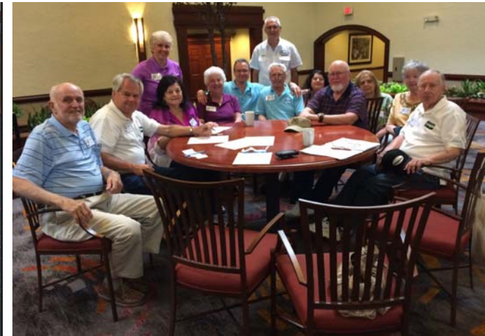
We even had time for a brief meeting.