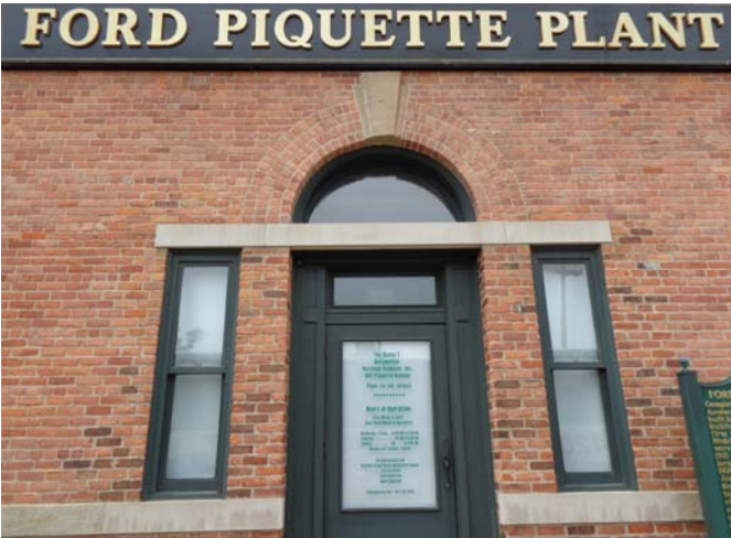
Tour of Henry Ford's first factory, the Piquette Plant