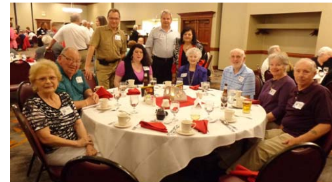
Banquet Dinner Dance